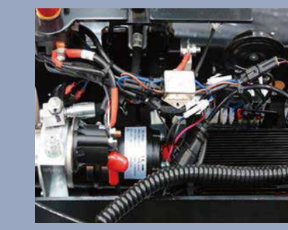
One-piece cover, covering almost all importa