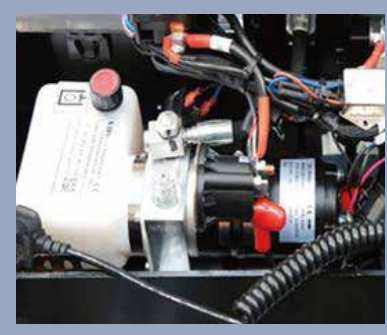
Integrated hydraulic unit, compact structu less space