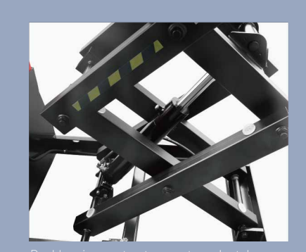
Double scissors structure, rectangue profile, more stable and stronger