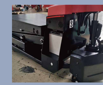
The batteries can be removed conveniently, f