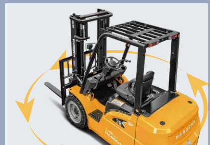
Turning radius reduced