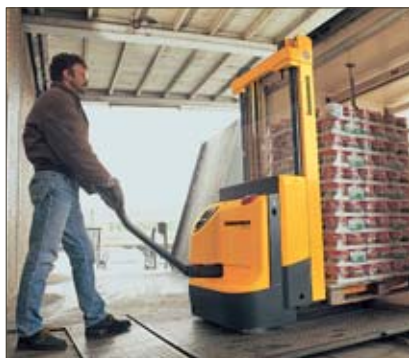
Travel over loading ramp with EJC Z