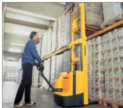
Stacking with EJC Z14

Space-saving through crawl speed button: to reduce the turning radius, the separate