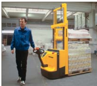
Doubledeck transport of two pallets

tiller switch also facilitates manoeuvring with the tiller in upright position.